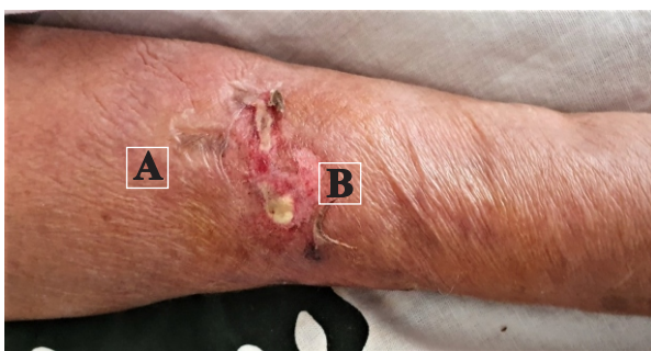
Figure 1: Wound Site A - Regressing blister, B - Ruptured blister

She was afebrile on admission, however, developed redness and swelling at the cannula site few days later. Next day, she fell in the hospital toilet and landed on the infected forearm. This toilet was a squatting type with water sourced from the local municipal council supply. There was no visible faecal contamination. Three days later, she developed severe infection with blister formation at the infected site with high fever spikes (Figure 1). There was no history of any local treatment to the site including ayurvedic preparations or salt.